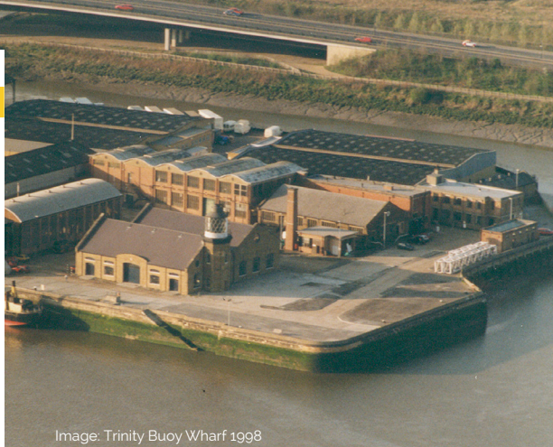
Image: Trinity Buoy Wharf 1998

In 1998, Trinity Buoy Wharf was an empty, derelict site. Now it is a place with studios for people in the creative industries, workspace for people who work to provide transportation on the river, classrooms for education, and indoor and outdoor spaces for arts events and a wide range of activities from conferences to product launches.